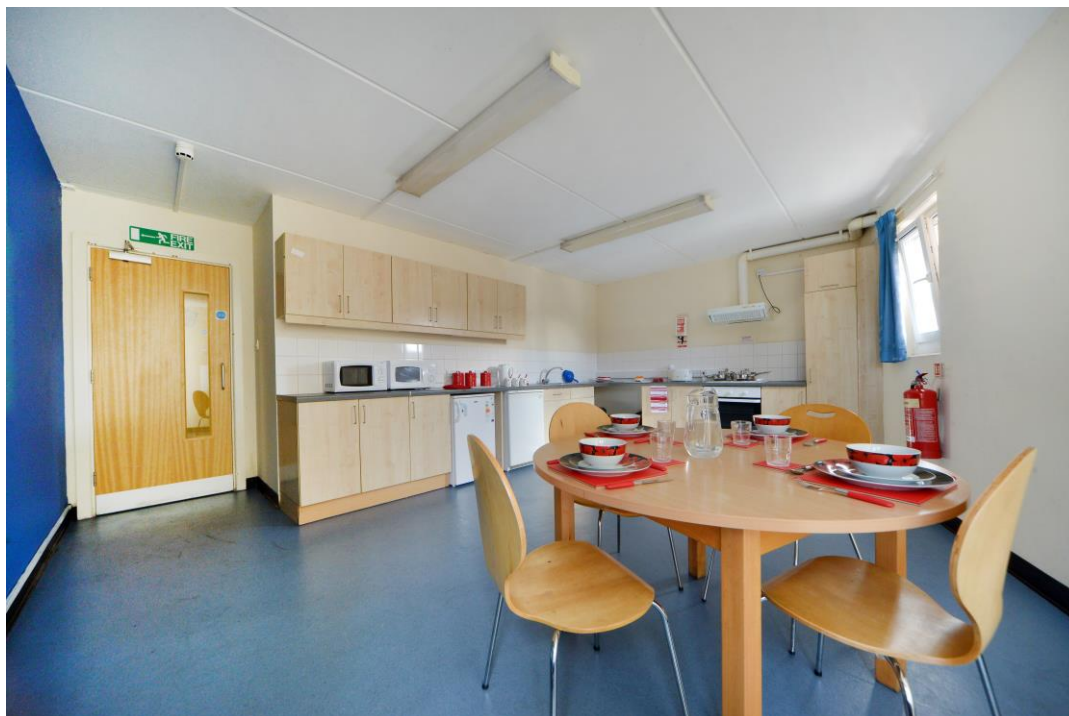
Standard Cluster & Standard Cluster PLUS kitchen/diner