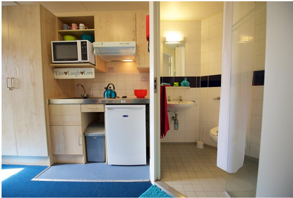
Studio Flat kitchenette and bathroom