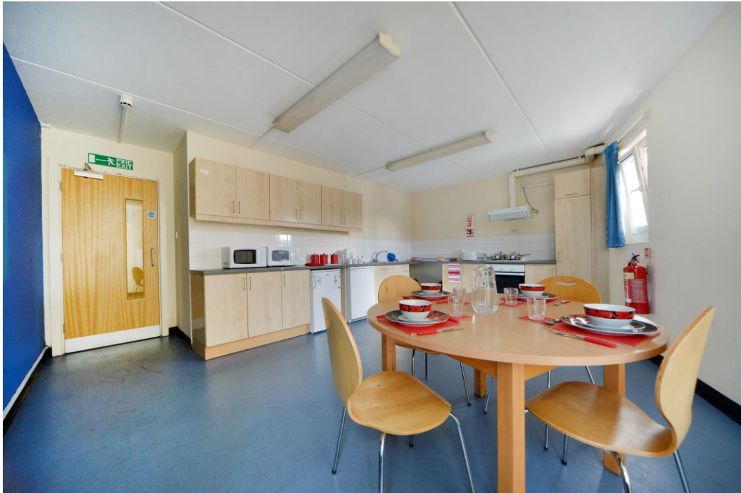
Standard Cluster & Standard Cluster PLUS kitchen/diner