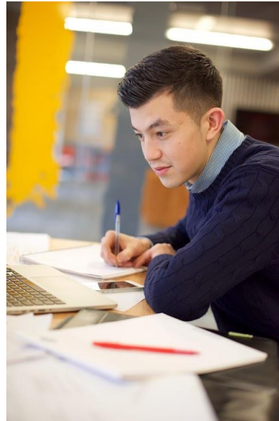
Studying in the Common Room at McMillan Student Village