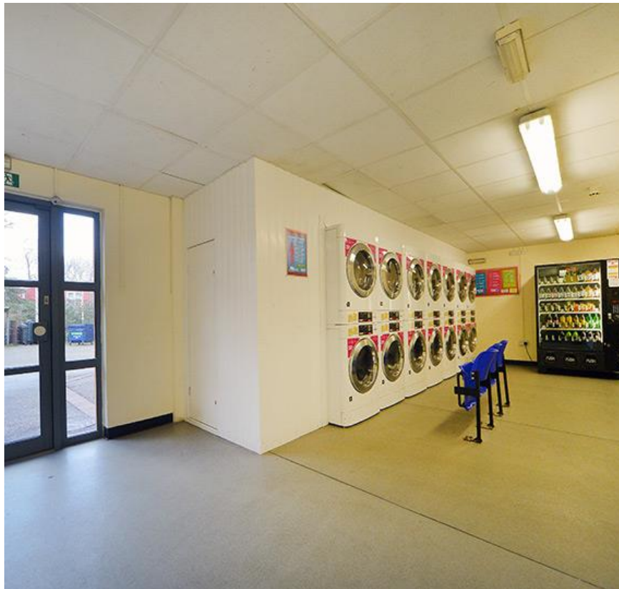
Self-service laundry room or known in the UK as a Laundrette

You will also be responsible for arranging your own TV licence, if you have a TV in your bedroom. If you are in a cluster flat you should note that each bedroom requires its own TV licence. Any TV in the communal areas, i.e. your kitchen/diner, will be covered by a TV licence registered to a bedroom within the flat. 1