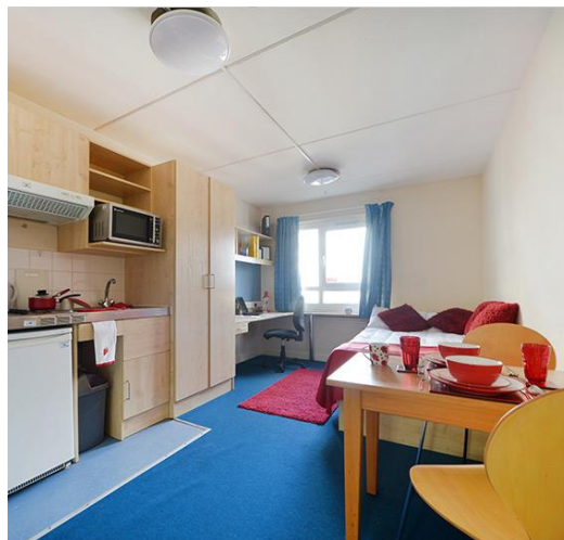
Studio PLUS Flat

Same layout as a Studio Flat but with more space and a larger bed.