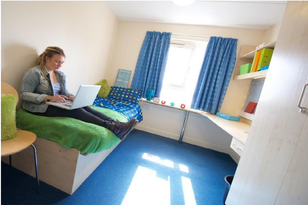
Standard Cluster Flat

These follow the same set up as the Standard Cluster Flats but with a slightly bigger room (still with a single bed).